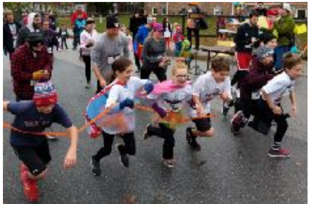
Pictured here are some of the winners from the Track and Treat races and costume contest. Read more at www.vsnb.org/track-and-treat .